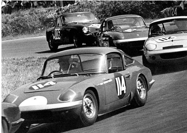
SM1 race no 114 and SM2 race no 113 making a sandwich of Elan race no 112

race them as Team Surbiton Motors. Whilst Shapecraft made up these two roofs on the new buck, they introduced Perspex side windows behind the B pillar and a ventilation slot in the rear of the roof, running almost the length of the rear Perspex window. These side windows and vent were only ever fitted to these two 26R Elans and never to any other Shapecraft Elan. Barry's car would become road registered in Leicestershire as RFP 696B, whilst Les' car received the Surrey number BPE 230B.