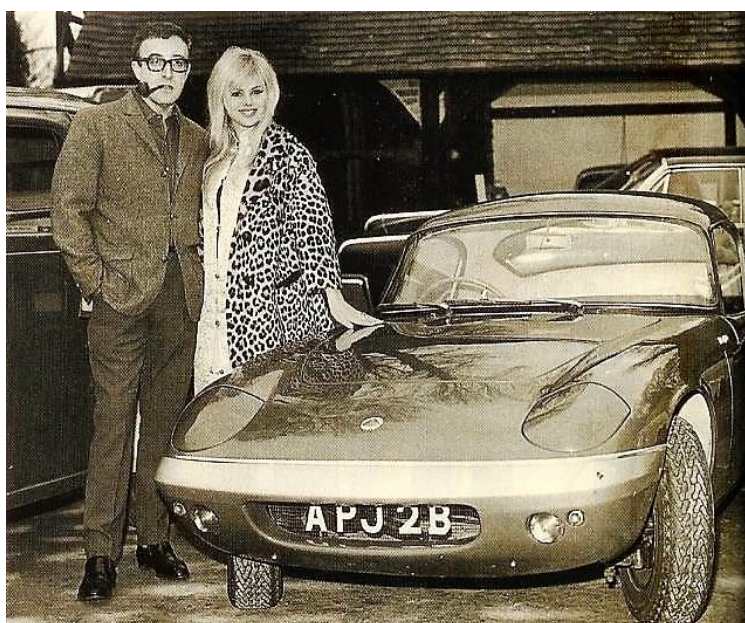
The red Shapecraft Elan that Peter Sellers had just given to Britt Ekland to celebrate their forthcoming wedding

To further complicate matters for us, the car exhibited at the Racing Car Show was almost immediately sold to Peter Sellers, re-registered in Surrey APJ 2B and given by him to Britt Ekland to celebrate their engagement. In fact they had met in early February and were married by 19 February 1964. Quick work, Peter!