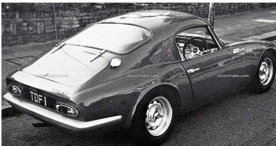
TDF 1 showing the neat treatment where roofline meets rear valance.

The table below is not intended to be definitive, merely an easy way to identify those Shapecraft Elans we have been able to write about or subsequently informed of. Some of the cars listed may in fact be one and the same.