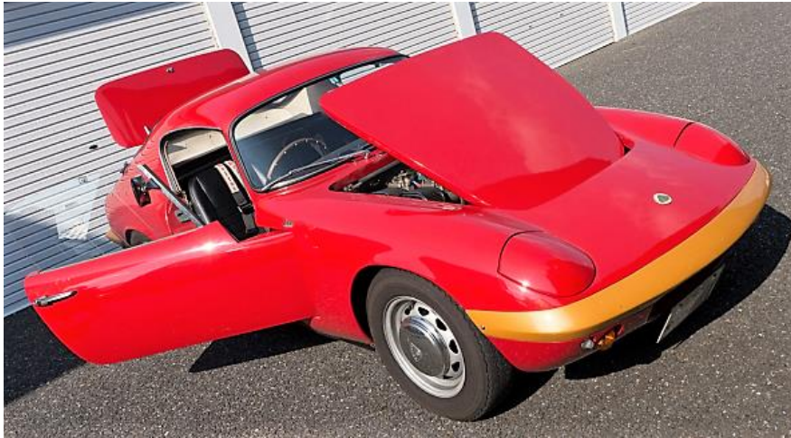
26/0016 at home in Japan.

We are aware of only two other Elans fitted with the Shapecraft conversion from this time. Unit 26/3141 was bought in August 1963, apparently by a milkman based in Brecon, Wales. It was registered as 55 GUL in London, presumably by the supplying dealership. A very early Elan, unit 26/0016, had been delivered to its new owner with a Lancashire registration, 7360 TJ in March 1963, well before the Shapecraft concept had been thought of. It is presumed that the Elan was subsequently delivered at some stage during the autumn to Surbiton to have its touring Shapecraft roof fitted.